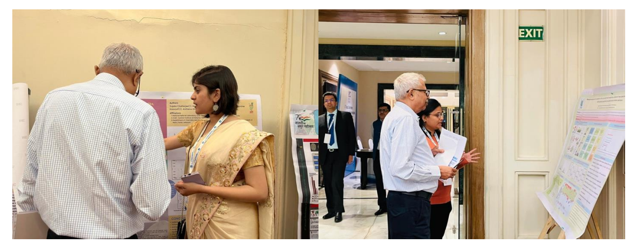
NRCG presenters with a jury member