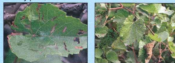
Leaves affected by Chafer and Flea beetle (left) and Rust infection (right)

iii. During early phase growth, insects like flea beetle, chafer beetle and caterpillars may attack on the growing parts of the plants. Spray of Carbaryl 2g/l or Malathion 2ml/l or Neem-oil 2ml/l can control the infestation. Drenching of Chlopyriphos @ 2 ml/lit. water can control the termites during the period of high temperature.