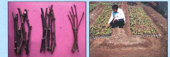
Selection of Hardwood cuttings for planting and regular inspection of nursery