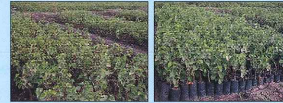
Nursery plants in beds and poly-bags

Multiplication of nursery plants can be done on raised beds or in nursery bags.