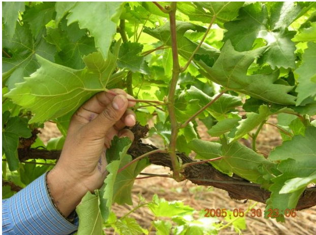
Figure 1. Petiole/leaf position during BDS

Bud differentiation stage (BDS): Petioles should be collected from recently mature leaf which is generally 5<sup>th</sup> leaf from the base during this stage i.e. approximately 40-45 days after foundation pruning (Fig.1).