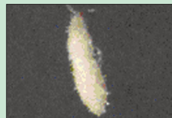
Thrips infected with V. lecaniiti