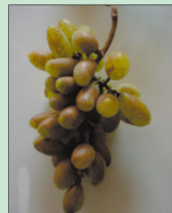
Fruit scarring by thrips