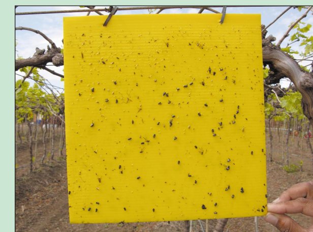
Yellow sticky traps

Regular scouting is necessary to detect early infestations and also monitor the efficacy of control measures. A crop scouting program includes both sticky trap cards and visual inspection. Scouting should be done once a week. A gentle tapping of the blossoms and growing points aids in visual inspection. Install 4-5 blue/yellow sticky coloured traps per acre.