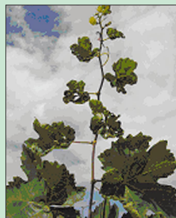
Thrips affected leaves

obtained from seriously attacked plants are of poor quality and fetches low price in the market.